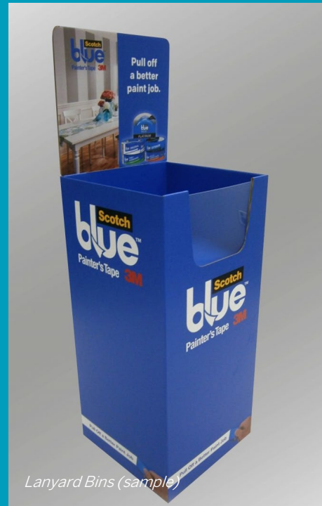
Lanyard Bins (sample)