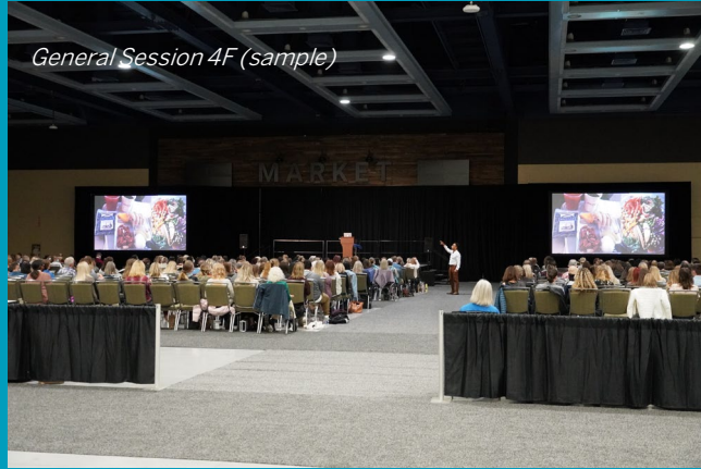
General Session 4F (sample)